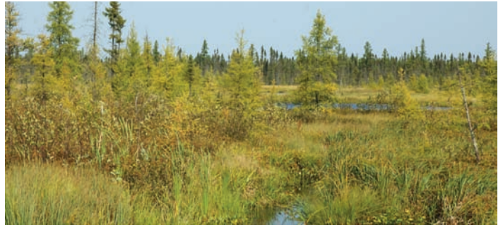
Cranberry Peatlands Interpretive Trail