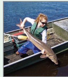
Lake Sturgeon tagging on Rainy Lake