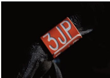
Double-crested Cormorant chick band

3. Chick banding. VNP staff, with assistance from the OMNR office in Fort Frances, have been banding cormorant chicks in Rainy Lake since 2008. Each chick is weighed, measured, and affixed with an aluminum numbered leg band and a plastic colored leg band (orange band with white letters in the format Number-Letter-Letter). We banded over a 100 chicks in 2008 but less than 30 in 2009 because of heavy