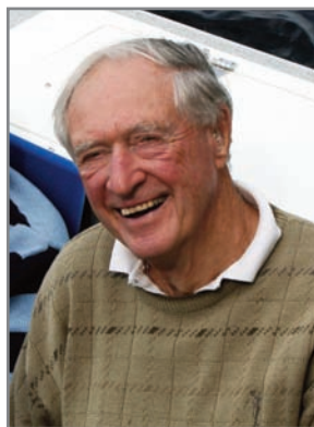
April 23, 1919 - February 15, 2010