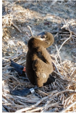
Banded cormorant chick

will compare results from the Rainy Lake colonies to others in Minnesota and North Dakota. Chick predation by gulls and eagles was very high in 2009 on Rainy Lake, and the Seven Sisters colony did not fledge any chicks. Data analysis is in progress but we expect preliminary results to be included in a 2009 Progress Report due in Summer 2010.