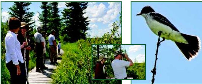
Hikers and Eastern Kingbird on the Cranberry Peatlands Interpretive Trail, July 2010