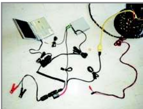
Multi-SeaCam with recording and viewing components

High Falls. Other cool sturgeon facts. Dr. McLaren shared many amazing facts about Lake Sturgeon. For example, they have no bones, only cartilage. They are aged by counting the rings in the cartilage much like counting the rings in a tree.