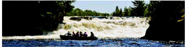
A portion of High Falls on the Namakan River